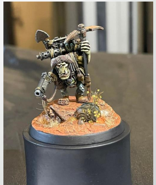
Open