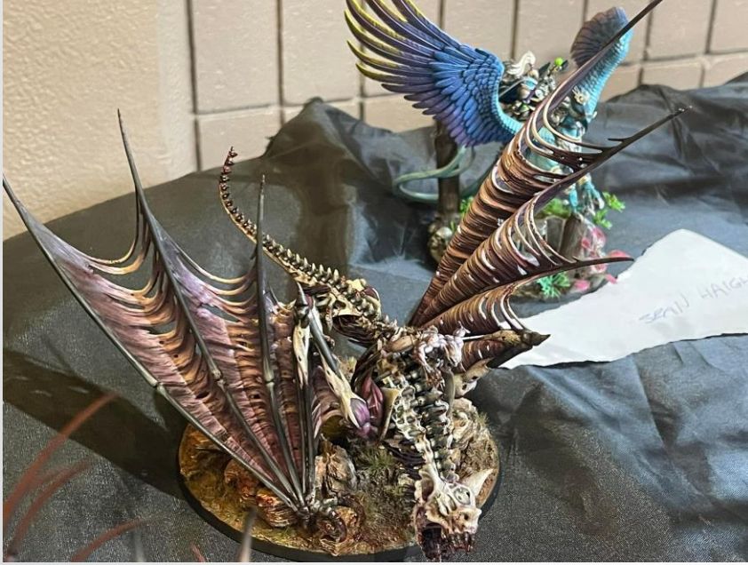
Monstrous Marvel