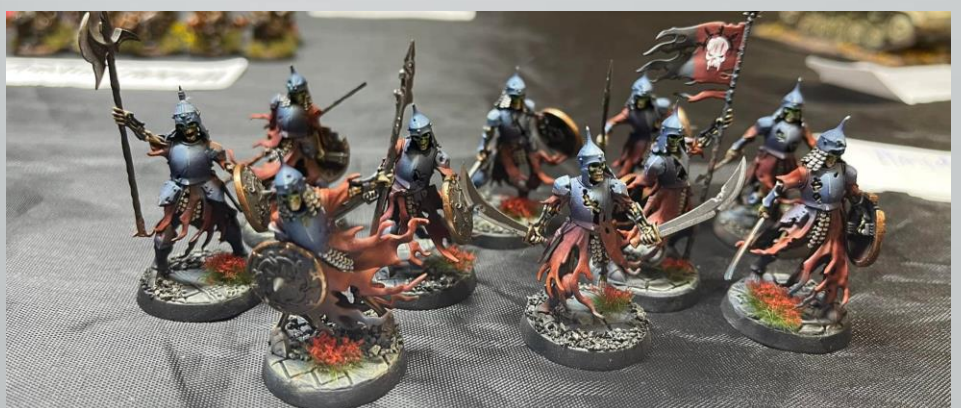
Regiment of Renown