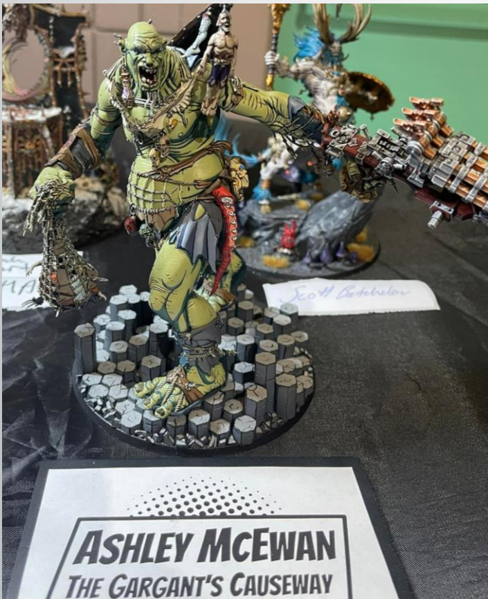
The Masterpiece