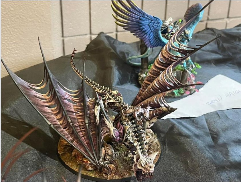
Monstrous Marvel