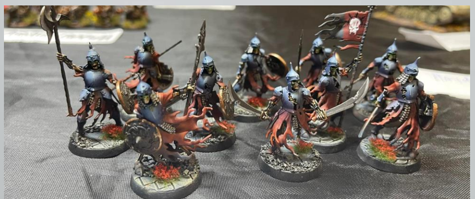
Regiment of Renown